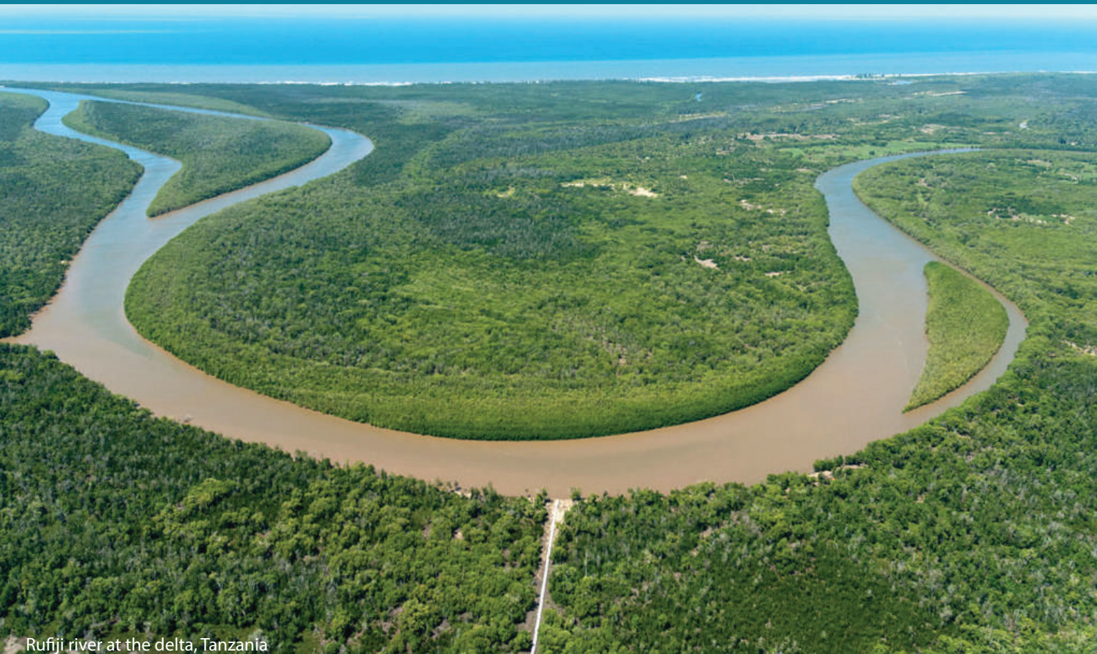
Rufiji river at the delta, Tanzania

Supporting Tanzania Development Vision 2025 and Sustainable Development Goals