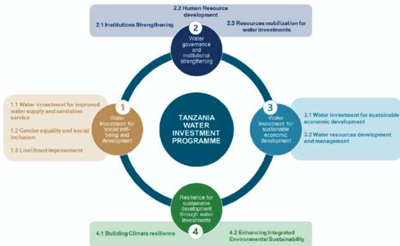
Figure 1. Tanzania Water Investment Programme

The Tanzania Water Investment Programme is structured in 4 investment Focus Areas, 10 Components, and 33 Priority Intervention Areas as indicated in Figure 1 and Table 1. In addition to improving and expanding water services, aspects of building climate resilience and strengthening governance and institutions are critical areas that the Programme will focus.